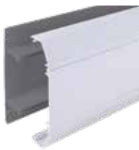
Sterling Profile 1 trunking assembly