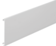
Main compartment cover

Please note the colour of the unseen base ETB1M may vary