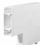
Profile 3 Flat angle