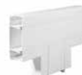
Profile 3 Flat tee