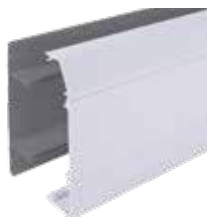
Sterling Profile 2 trunking assembly

Charcoal is available as standard for Profile 1