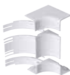
Profile 3 Internal bend assembly