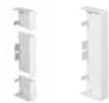
Profile 3 End cap