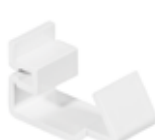
Angled cable retainer