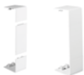
Profile 3 Coupler