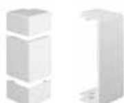
Profile 3 External bend