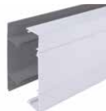
Sterling Profile 3 trunking assembly